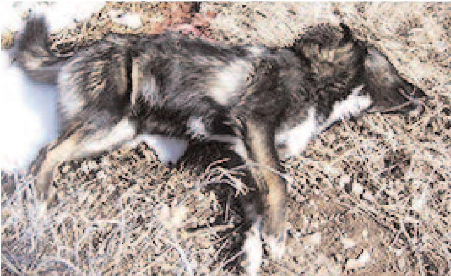
Two wolf-like animals shot north of Luna, N.M., in December 2006. A landowner saw three of them killing a yearling elk and since the FWS wouldn’t investigate, the landowner took a chance and shot them. Due to the proximity to known Mexican wolves, it’s believed they may be Mexican wolf hybrids. FWS is DNA testing these animals. OPPOSITE: A close-up of a Mule Creek animal.

Arizona State University to determine the genetic status of its “wolves.” The study examined blood samples and concluded that “they likely represent the descendants of pure Mexican wolves.” This left many to wonder by what sort of alchemy animals that were dog hybrids (according to visual inspection) could be thus transformed.