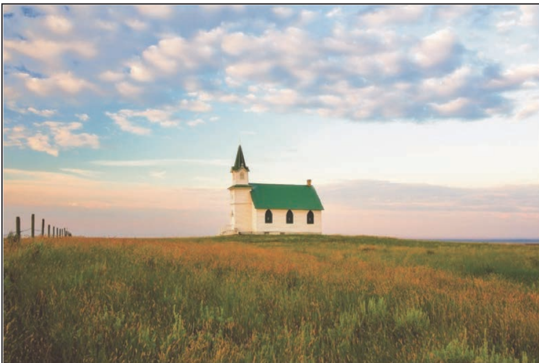
From "Rural Churches" by Todd Klassy