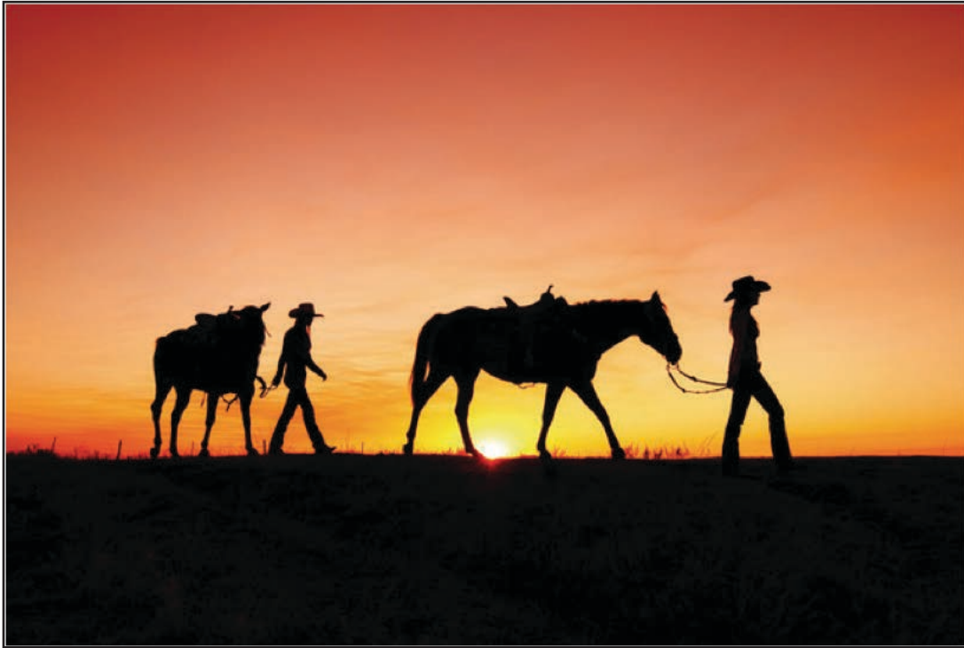
"Kinship" by Todd Klassy

(Entries were for Summer 2021 "Kinship," Fall 2021 "Small Towns," Winter 2021/2022 "The Perfect Catch," and Spring 2022 "Rural Churches.")