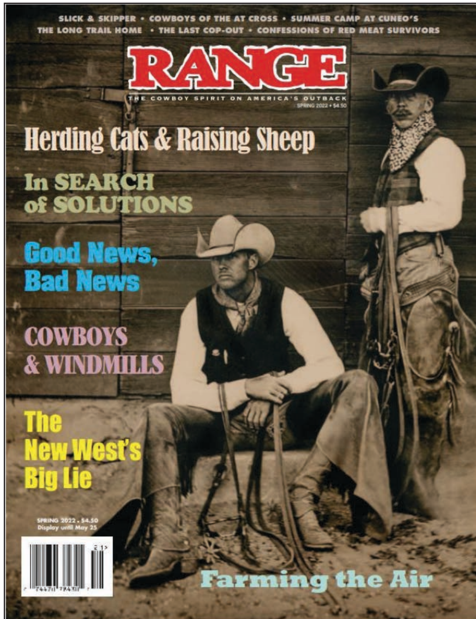
Texas Cow Punchers, Cover by Robb Kendrick

Judge’s Comment: “Good composition, cropped well for magazine cover, slight out of focus feel makes it look like an old-time photo. Very nice touch.”