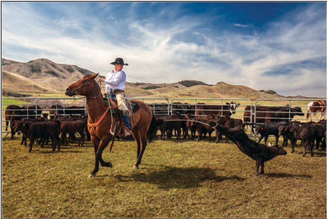
"The Perfect Catch" by Todd Klassy