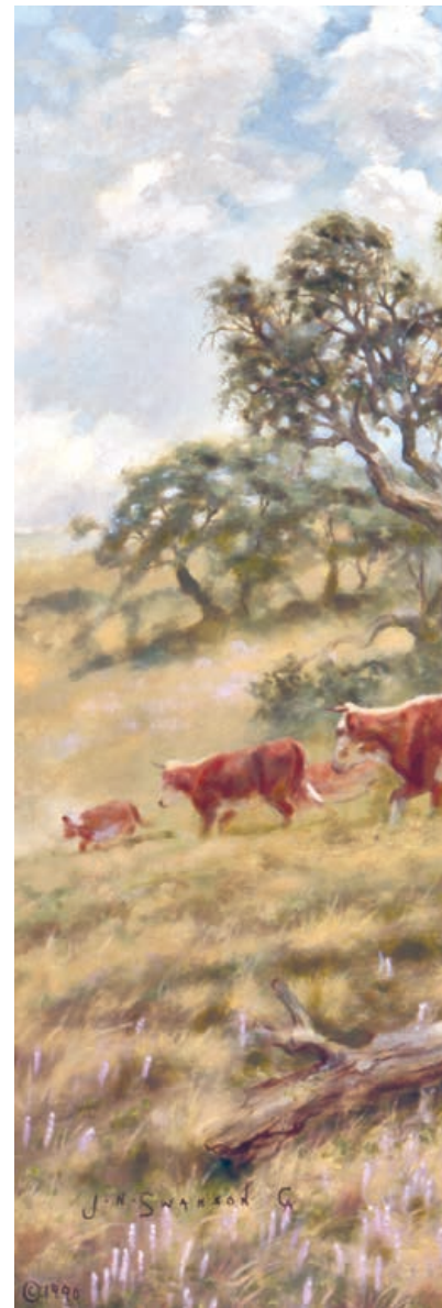
“Fall Gather, California” 48” x 32” oil