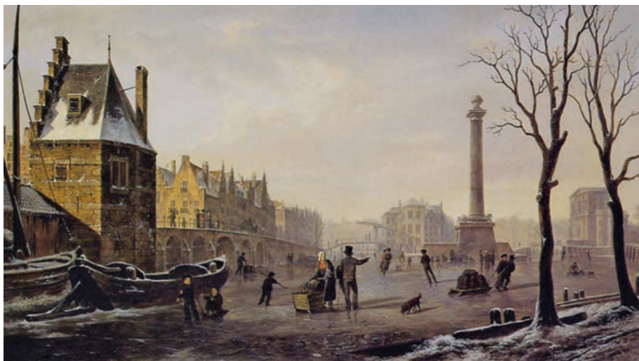
Painting of winter skating on the main canal of Pompenburg, Rotterdam, in 1825 during the Little Ice Age. Holland’s canals froze every year as did the River Thames in London. Growing evidence suggests the earth may be commencing a new Little Ice Age.