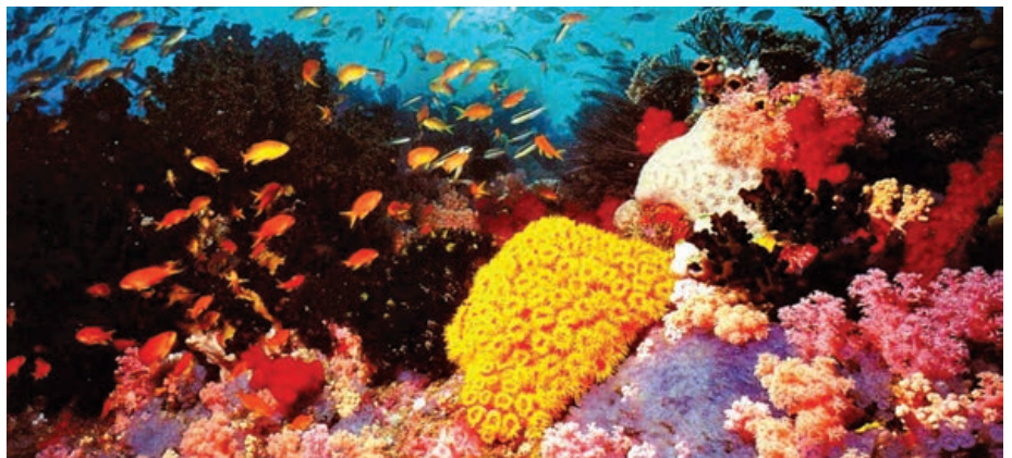
During his new speech on global warming, President Obama used the “bleaching” allegedly caused by global warming as an example of the type of devastation caused by global warming. What he and his advisors didn’t know is that the Great Barrier Reef has made a spectacular recovery as is evidenced by this photo. Obama’s comment on the reef earned him a sharp rebuke from Australia’s foreign minister, Julie Bishop.

The arrogance (I’m right, you’re wrong) was classic Obama and assumes the character of the Queen of Hearts who really believes, as does Obama, she is never wrong. The Australian , the country’s largest newspaper, was stunned, writing, “Obama’s speech