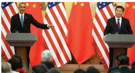
President Obama and Chinese President Xi Jinping announce their climate-change agreement in which the U.S. must reduce its CO 2 emissions to 26-28 percent below 2005 levels by 2025, while China gets to continue increasing emissions until 2030, and then only level them off. It is a terrible agreement.

On the final day of the U.N. Conference of the Parties in Peru, India warned that it would not agree to any treaty that undermines its economic growth and fight against poverty. Even earlier, the day after Obama's attack on Abbott, Germany had announced it was withdrawing from its binding 2020 emission reduction goals. It is building dozens of new coal-fired generation plants and there is no way it could meet its agreed-to goals. In 2013 Germany imported a record 51 million tonnes of coal to feed its new coal-fired generating plants.